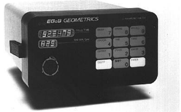
G-856AX Electronic/Battery Console

unit provides a repeatable absolute total field magnetic reading, traceable to the National Bureau of Standards, unlike other magnetic field measurement processes which measure only a single component of the field.