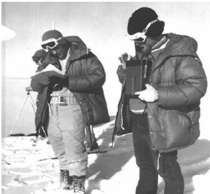
G-856AX Arctic Survey

The G-856 provides a reliable, low cost solution for a variety of magnetic search and mapping applications. Single key stroke operation means the G-856AX can be operated by non-technical field personnel or used in teaching environments. The G-856AX uses the established proton precession method, allowing accurate measurements to be made with virtually no dependence upon variables such as sensor orientation, temperature, or location. The